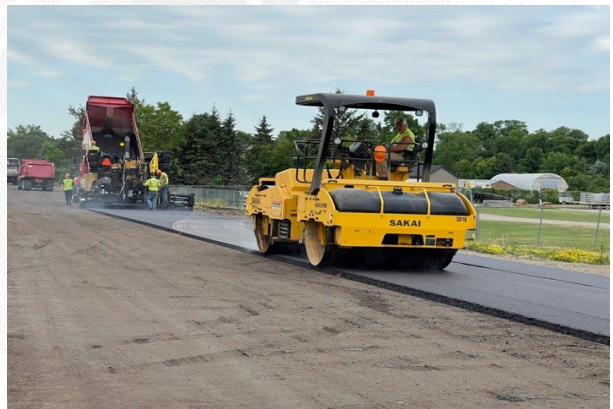
Paving of Hornsby Street in June of 2021

This portion of Hornsby Street is the main thoroughfare in the City's Highway Commercial and General Business Zoning Districts. Completing this