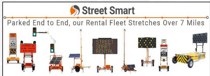
Street Smart Rental

Approvals were recently granted for one of those lots to Street Smart Rental, a traffic safety equipment rental and sales company. Street Smart is the industry’s largest rental provider of specialized traffic safety equipment.