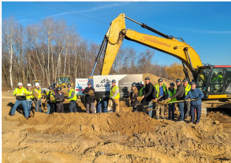
EDA Members Attend a Ceremonial Groundbreaking of the EcoFun Site in Columbus

The other visible change to the area is located on the west side of the I-35 interchange, next door to the newly-finished Viking Industrial – EcoFun Motorsports. EcoFun is in the process of constructing a 31,000 square foot building that will house a storefront, warehouse, and