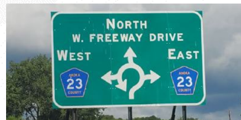
North West Freeway Drive Roundabout Sign

Transportation projects never seem to stop in the City of Columbus, and 2022 will be no different. A kickoff meeting will be held in January to begin discussion on the extension of W. Freeway Drive to the north. A roundabout was recently installed at the intersection of W. Freeway Drive and Lake Drive,