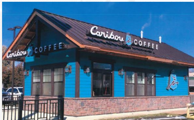
Caribou Cabin Concept in St. Peter, MN

The City Council recently approved a site plan for a Caribou Cabin just off Hornsby Street to the north of TH-97. This location will provide drive-thru service, with limited seating outside the building. This is a new concept for Caribou Coffee and other coffee businesses throughout the country. This establishment will undoubtedly draw attention and traffic to the City.