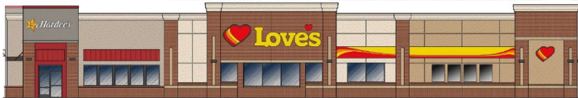
North Elevation of Columbus' Love's Travel Stop

The most visible and talked about change in the freeway district in 2021 was the beginning of the Love’s Travel Stops development in the southeast I-35 quadrant. Crews officially broke ground on October 11 th , 2021, to begin construction of the considerably sized travel plaza.